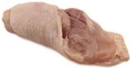
Thigh boneless, skin on/ Haut de cuisse desosse avec peau