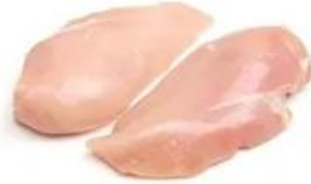
Breast Fillet / Fillet de poitrine