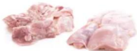
Leg skinless, boneless/ Cuisse desosse, sans peau