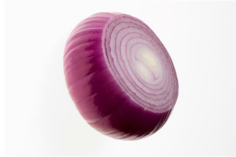
Peeled red onions