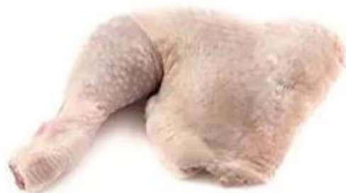
Leg quarter/ Cuisse avec quart arriere