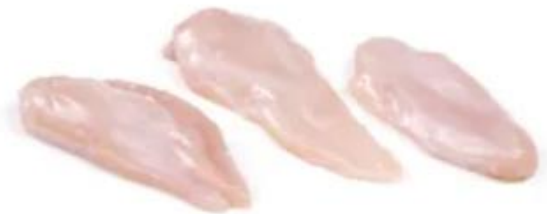
Breast Fillet / Fillet de poitrine