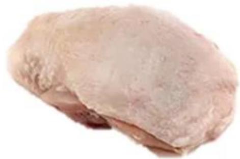
Thigh bone in, skin on/ Haut de cuisse avec peau