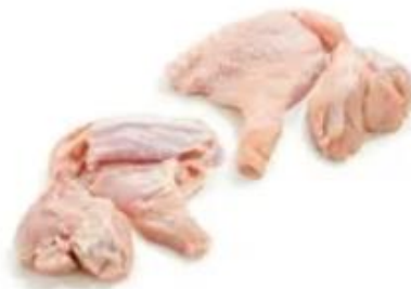
Wing meat boneless skin on/ Ailes desosse, avec Peau