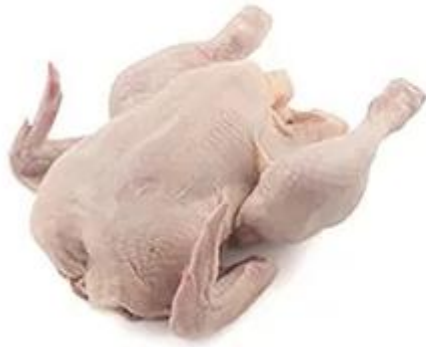
Whole chicken/ Le poulet entier