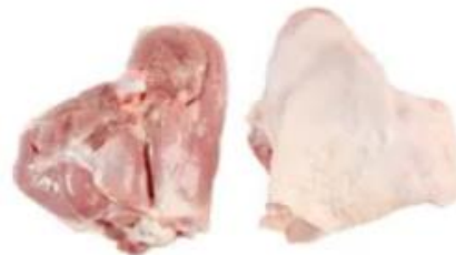
Thigh bone in, skin on/ Haut de cuisse avec peau