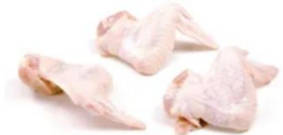
3 joint wing/ Ailes 3 phalanges