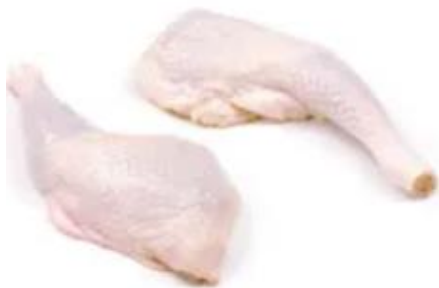
Leg quarter/ Cuisse avec quart arriere