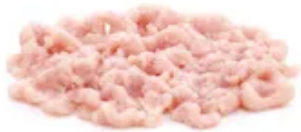
Minced meat/ Viande hache