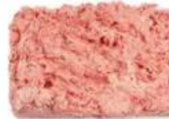
MDM/ VSM de poulet