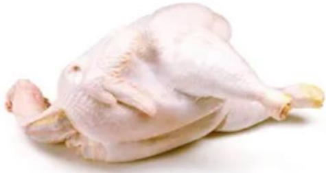
Whole heavy hen/ Poule Lourde