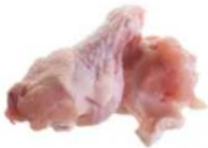
Prime wing/ Manchon