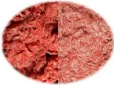
Red or white minced meat/ Viande hachée rouge or blanche