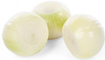
Peeled yellow onions