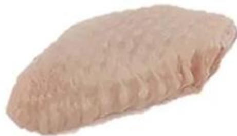
Mid wing/ Aileron