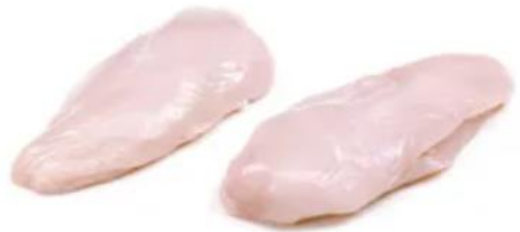
Breast Fillet / Fillet de poitrine