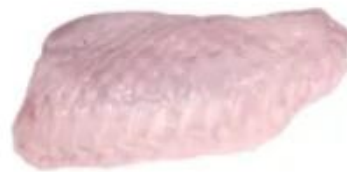
Mid wing/ Aileron