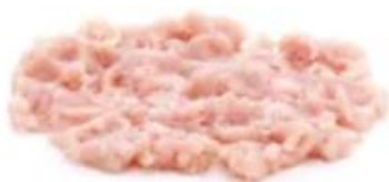
Minced meat/ Vainde hachee