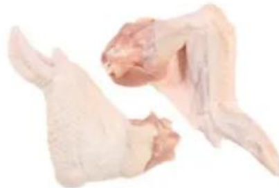
3 joint wings/ Ailes 3 phalanges