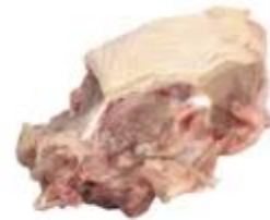
Upper back/Haut de poitrine