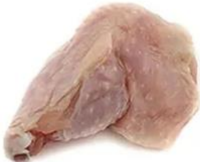
Prime wing/ Manchon