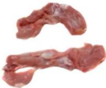
Wing meat boneless skinless/ Ailes desosse, sans peau