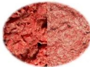
Red or white minced meat/ Viange hachee rouge ou blanche