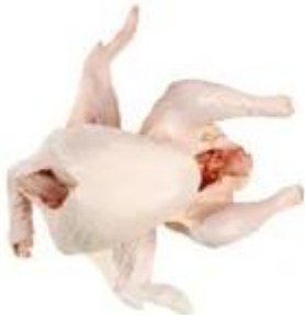
Whole turkey/ Dinde entier