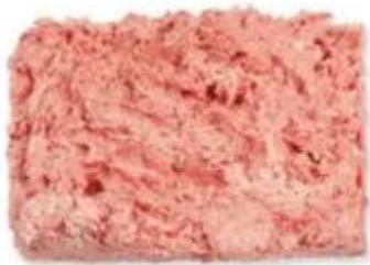
MDM / VSM de dinde