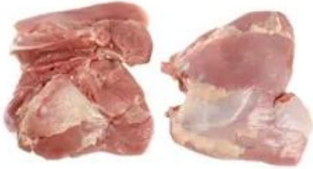
Thigh skinless, boneless/ Haut de cuisse desosse, sans peau