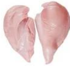
Breast Fillet / Fillet de poitrine