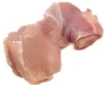
Thigh skinless, boneless/ Haut de cuisse desosse, sans peau