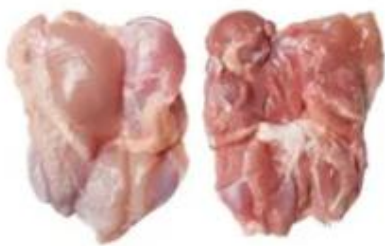
Leg meat skinless boneless/ Cuisse desosse, sans peau