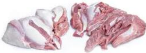
Drumstick meat skinless boneless/ Ailes dessosses, sans peau