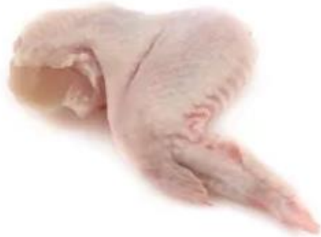
3 joint wing/ Ailes 3 phalanges