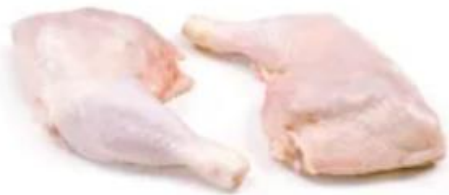
Leg quarter/ Cuisse avec quart arriere