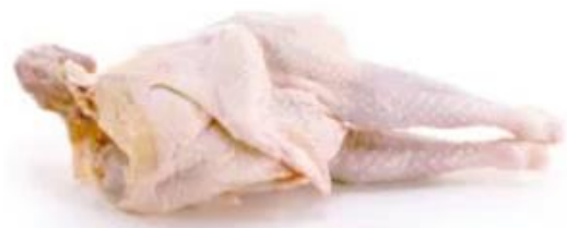
Whole hen light/ Poule legere